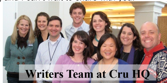
Writers Team at Cru HQ

This will also be a fantastic opportunity for me to develop my heart for church partnership. This summer, I have been creating tools that clearly communicate practical ways for church members to reach their local campus, and folks at headquarters have already voiced interest in running with it.