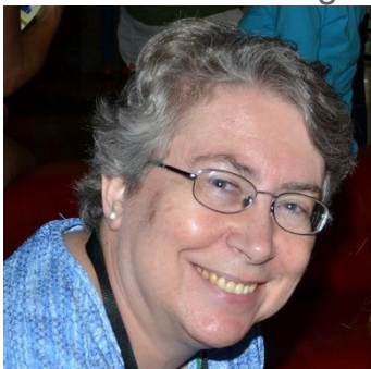
This is what the LORD requires

Please pray for their upcoming conference in South Africa, where Christian judges, attorneys and paralegals from around the world will come together to combat corruption, human trafficking, segregation and persecution.