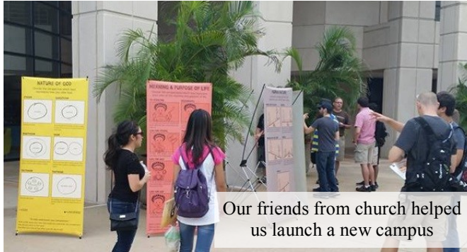
Our friends from church helped us launch a new campus

By the end of the day, over 200 students filled out surveys indicating interest in helping launch Cru on their campus. At least 4 people heard the entire gospel and two people prayed to ask Jesus to be their Lord and Savior! Praise God for all He is doing, and please continue to pray for Valencia College's East campus and for more