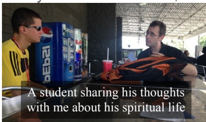
A student sharing his thoughts with me about his spiritual life